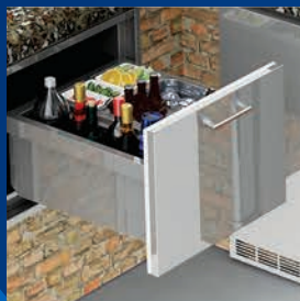
Undercounter Ice Bin