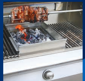
Solid Fuel Insert