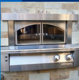
Pizza Oven Plus

Get YOUR PASSION IGNITED™ for cooking outside with more premium kitchen products for your buck. For a limited time, Alfresco is offering a cash-back rebate that can let you expand your cooking experience with MORE WAYS TO COOK than any other outdoor appliance brand!